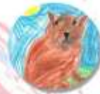
TL Primary School